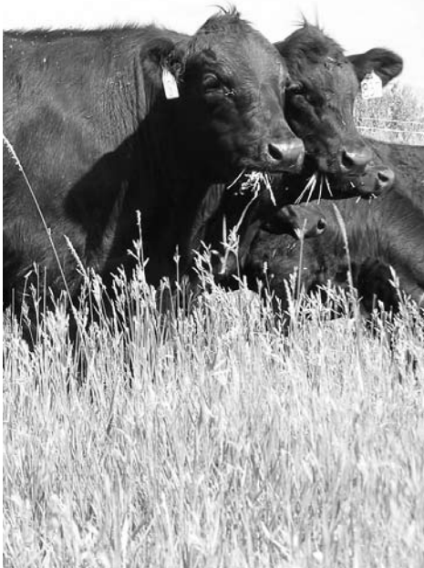
Princess Grass-Fed Beef

In June we tried something new. We artificially inseminated the animals that we didn't want bred to their sire. We were able to use semen from Johnny Be Good, a