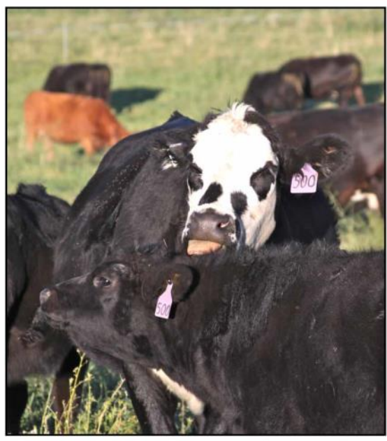
Calves are weaned at about six months old, usually across a fence, which makes the process less stressful for everyone.

That brings us back to the concept of holistic management. "Holistic management is where you form a goal as to how you want to see the future and work towards that. All our decisions we try and go back to that goal. My goal is to make ranching and agriculture sustainable. It isn't, really, right now,