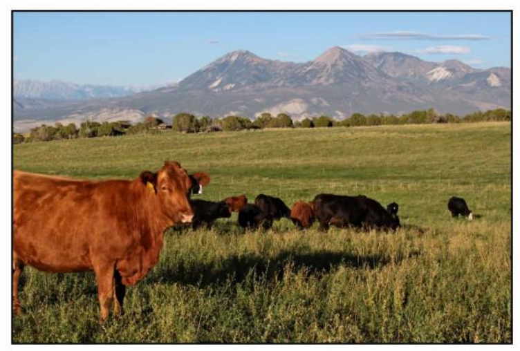
Fifteen years later, descendents of the original Princess provide a family with income and a community with wholesome meat.

A perfect and poetic touch for this thriving family business.